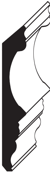
GS714LDF 30MM x 7-1/4 x 16'