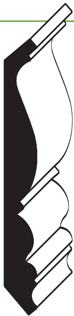
WM8 14LDF 25MM x 8-1/4 x 16'